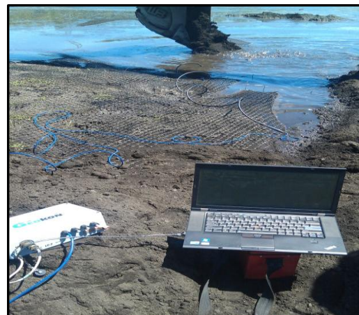
Figure 2B: Porewater Pressure Device Calibration