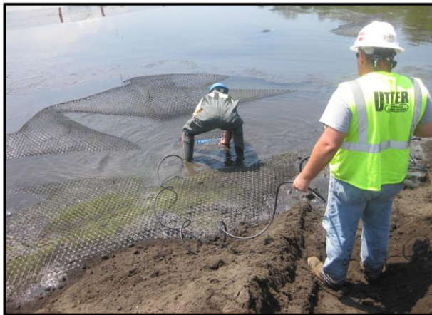
Figure 2E: Porewater Pressure Device Installation