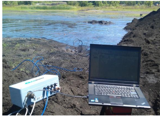
Figure 2D: Remote Transducer Readout Continuous Data Collection