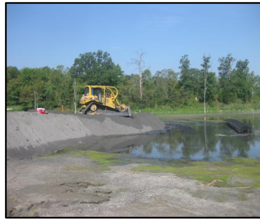
Figure 2F: Access Road Construction

The porewater pressure readings were obtained after placement of the surcharge loads, at 1 to 10 minute intervals, for a period of several days to several weeks. The porewater pressure readings and observations of the surcharge load placement indicated the following: