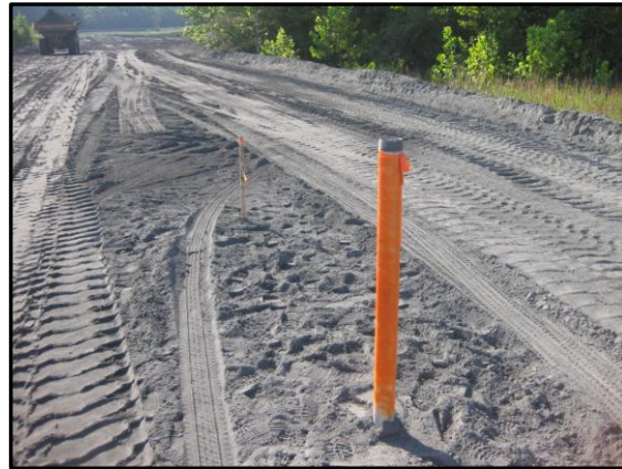
Figure 4B: Completed Settlement Plate Long term Monitoring

Observations in the field at the time the drilling access roads were installed, indicated that the most of the settlement in the near surface fly ash materials occurred in the first 24 hours after the surcharge loads were placed. This initial settlement was difficult to measure with the standard settlement plates, but the field observations indicated that 3 to 12 inches of settlement occurred in the soft saturated fly ash materials as the initial surcharge loads were placed. These field observations are consistent with the porewater pressure measurements shown in previous figures. The first three months of settlement measurements indicated the following: