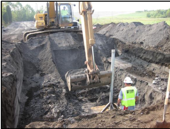
Figure 4A: Settlement Plate Installation

In addition to developing estimates of the amount of settlement using computational methods, the design team also installed settlement plates at locations near the DMT and CPT test locations. As of the writing of this paper the long term settlement measurements are still in the process of being compiled and evaluated. The pictures below demonstrate how the settlement plates were installed over the saturated flyash materials.