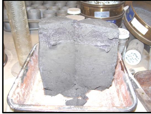
Figure 2: “Undisturbed” Fly Ash Sample Evidence of Compression During Sampling