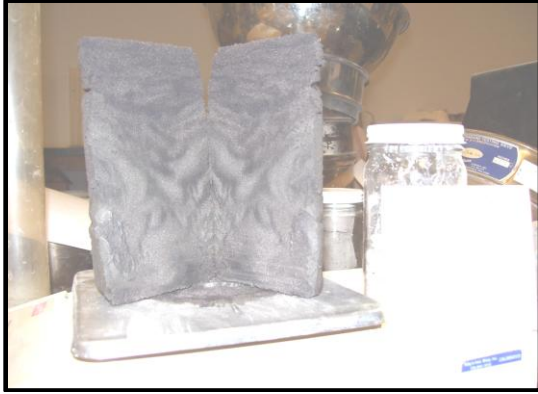
Figure 1: “Undisturbed” Fly Ash Sample Evidence of Vertical Mixing