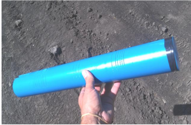
Figure 2C: Porewater Pressure Transducer in Protective Sleeve